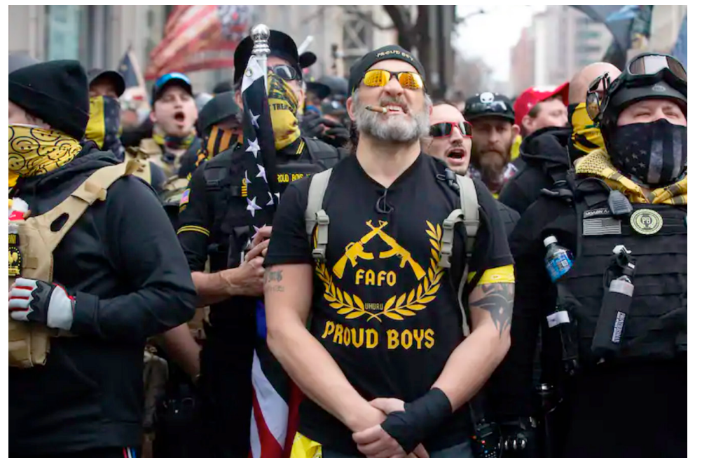
image: Proud Boys march in support of Donald Trump two days before the electoral college confirms the 2020 Presidential Election