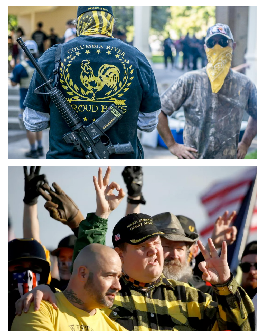
top: the logo of the Proud Boys worn by a member with long gun bottom: Proud Boys at a demonstration, December 2020