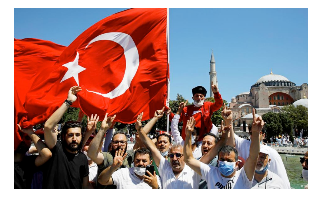
image: the Turkish Grey Wolves, a militant, nationalistic movement that emerged in the late 1960s