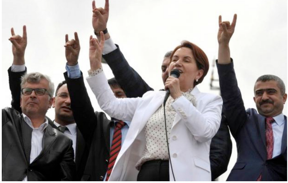
top: Grey Wolves flashing their salute bottom: ultranationalist politican Meral Akşener in 2018